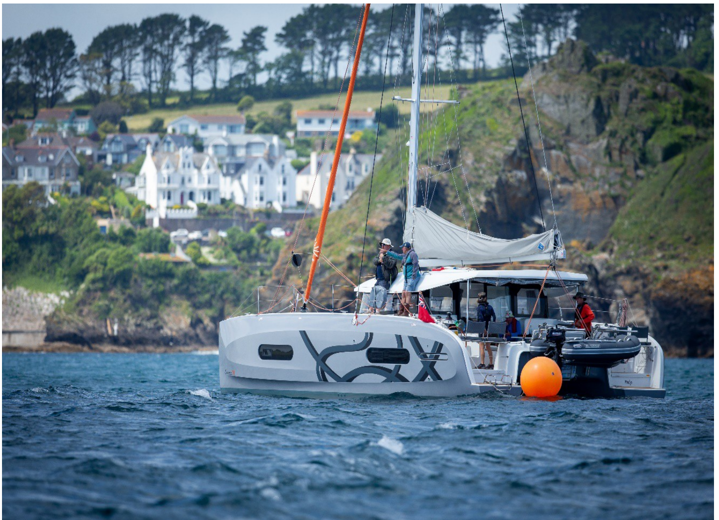
The splendid committee catamaran which we all managed to avoid hitting!