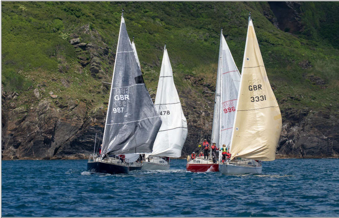
“Let the sails flap!”- early for the start.