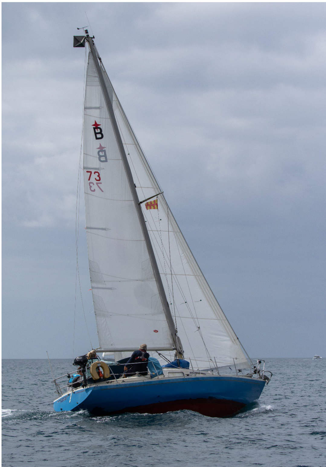
Cracklin' Rosie white sailing and racing for the first time ever!