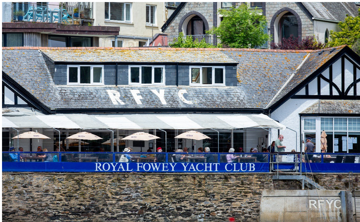
One of our host clubs.