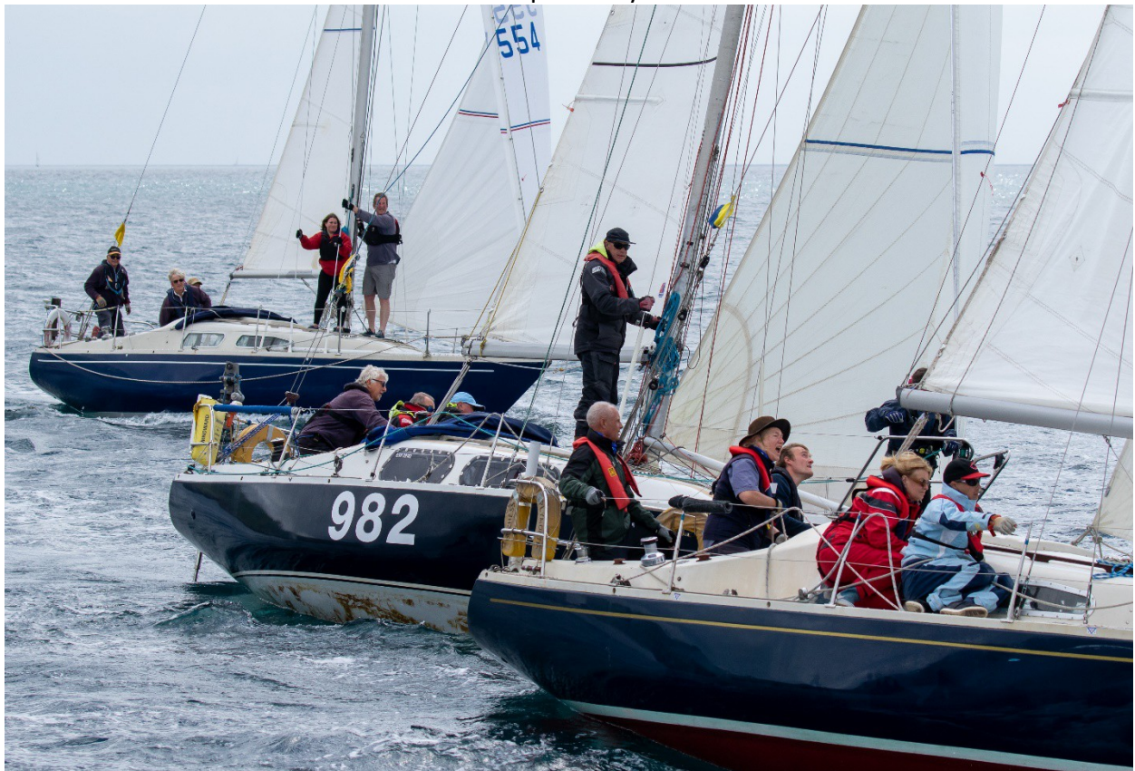
Close racing and lots of concentration.