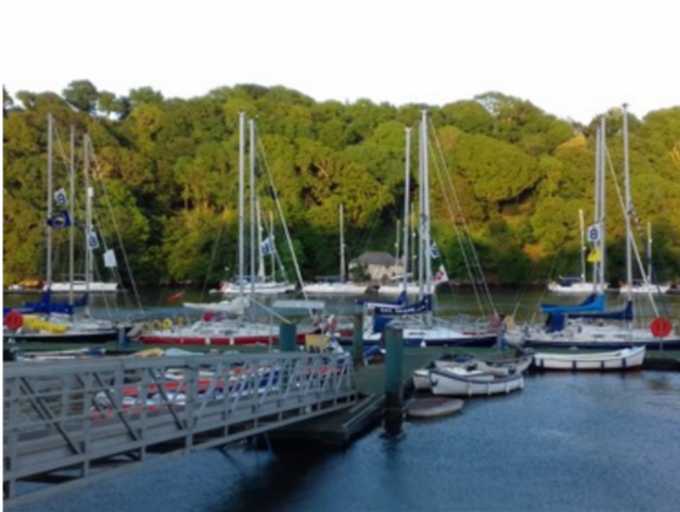
Twelve Ballads adorned the River Fowey for the 2017 Championships